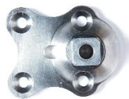
1737T Extreme Linear Offset 4-hole Pyramid (provides up to 20mm of offset) Ti – 100kg/220lbs