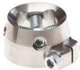
1705T Rotating Receiver Clamp Ti – 136kg/300lbs