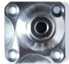
1727T Diagonal Offset 4-hole Pyramid (provides up to 12mm of offset) Ti – 100kg/220lbs