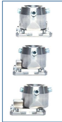
1718T Sliding 4-hole Receiver (12mm max. slide dist.) Ti – 100kg/220lbs