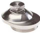
1725T Offset Rotating Receiver Ti – 136kg/300lbs