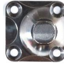
1717T Linear Offset 4-hole Pyramid (provides up to 7mm of offset) Ti – 100kg/220lbs