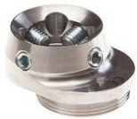
1704T Offset Rotating Receiver Ti – 136kg/300lbs